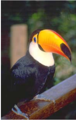
The toucan is one of the rainforest animals we learned about this week.